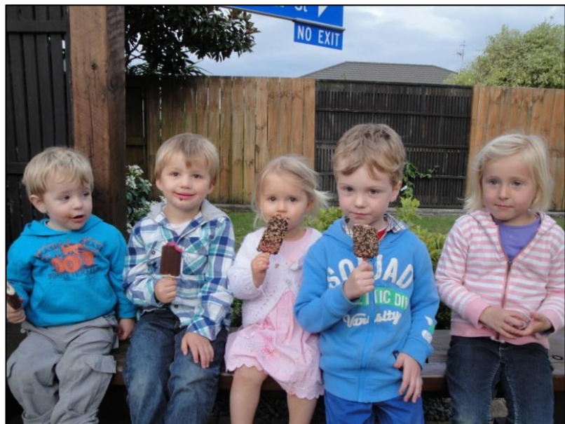
Ice Cream Fun at the Family Dinner held at the vicarage