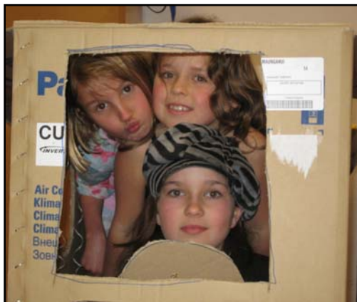
Smiles all round at the end of the day.

Many and varied were the things made - buildings, cars and aeroplanes to name a few. Time passed quickly as everyone was so busy and lunch time soon arrived. After lunch we went over the road to the park where the children all played games. Back in the hall for the afternoon we were all asked to make a car either individually or in groups. Imaginations went wild again and many and varied were the results and a real credit to them all. GM, Ford and Toyota - if they ever need designers they know where to come. An enjoyable day was had by all.