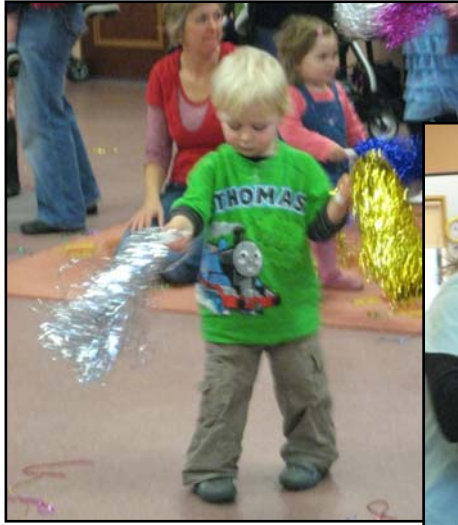
Jive Bunnies in action at St Mary's on Thursday mornings