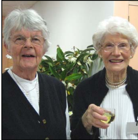
Friends gather for dinner to celebrate 150 years of Waiapu Diocese.