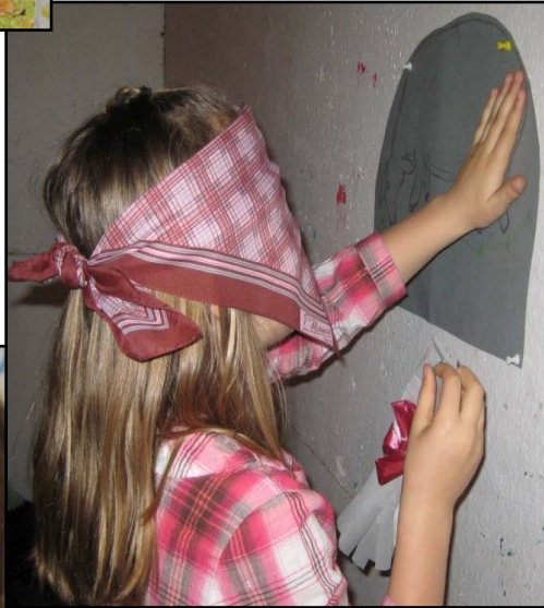
Attempting to pin the tail on the donkey

Moa Park Kids Club meets on Tuesday from 3.30 to 5pm at the Scout Hall on Valley Rd. It is for children age 5-8 years.