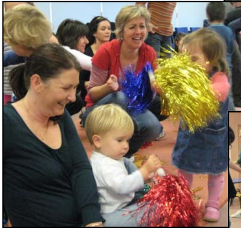
Mums, Dads and caregivers join in the action