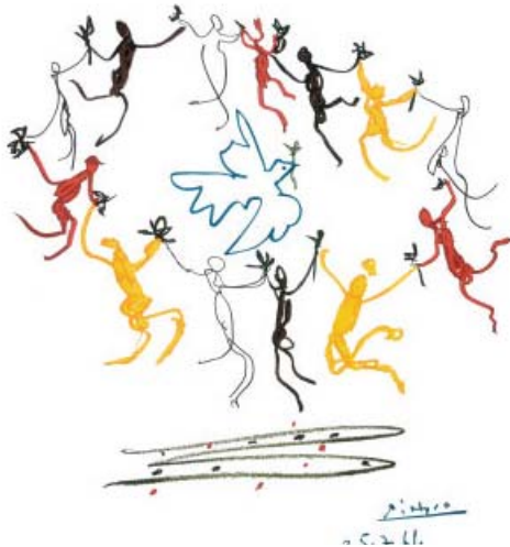
Picasso The Dance of Youth

The Pilgrimage cost is $50 per person including meals and accommodation, but you will have to pay for any additional activities you may want to do during the free time. For more information contact jocelyn.dymf@xtra.co.nz